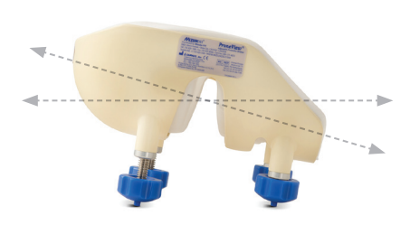
Independent adjustability for improved neutrality of the patients neck

Offers a 1.65" (4.19 cm) range of elevation for easier patient positioning